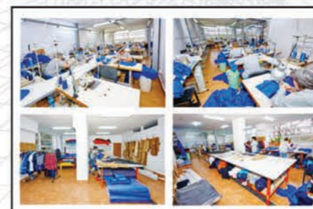
Insights from incubated company SC Xtreme Equipment SRL

ITA TEXCONF is part of the National Network for Innovation and Technology Transfer ReNITT and acts for the sustainable economic and social development of the textile sector, by ensuring access to technological performance, developing the innovative environment, introducing quality systems and developing human resources.