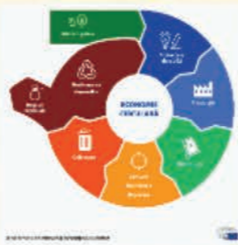
The Circular Economy a Model of Production and Consume