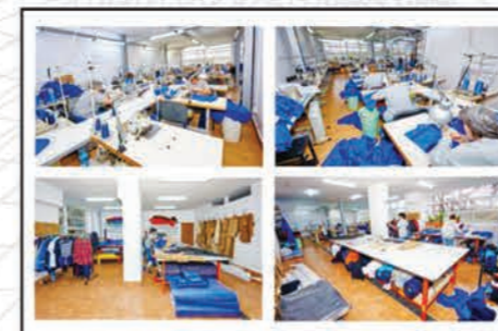
Insights from incubated company SC Xtreme Equipment SRL

ITA TEXCONF is part of the National Network for Innovation and Technology Transfer ReNITT and acts for the sustainable economic and social development of the textile sector, by ensuring access to technological performance, developing the innovative environment, introducing quality systems and developing human resources.